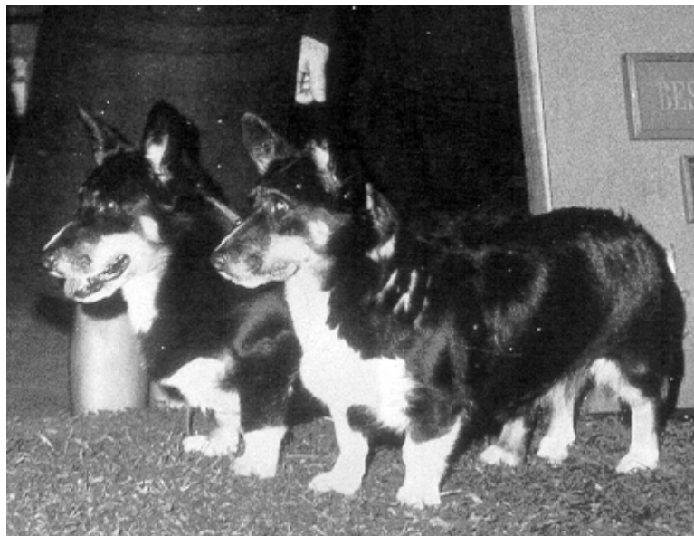
Ch. Swansea Claude and Ch. Swansea Gordon, Best Bracwe in Show at Golden Gate Kennel Club, 1968