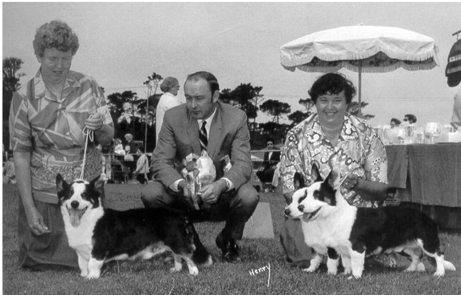
Ch. Lord Jim's Lucky Domino with two of his kids, Ch. Mar Dan's Shan Pilwr of Swansea (inside) and Ch. Swansea Lord of Rhydowen (outside)